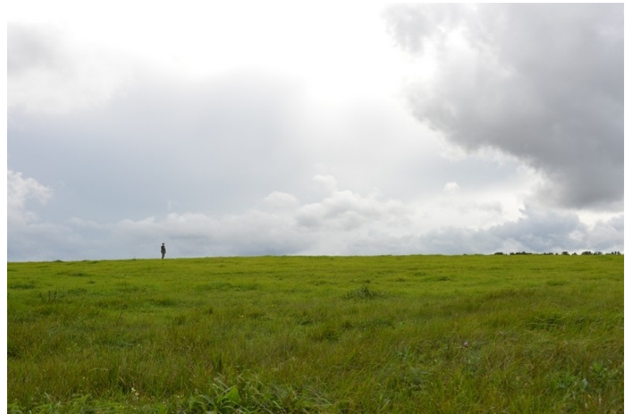
Sacred Grove Hill in Mahtra Village is a bare hill in the middle of a pasture and carries a special meaning for the followers of historic traditions mostly.