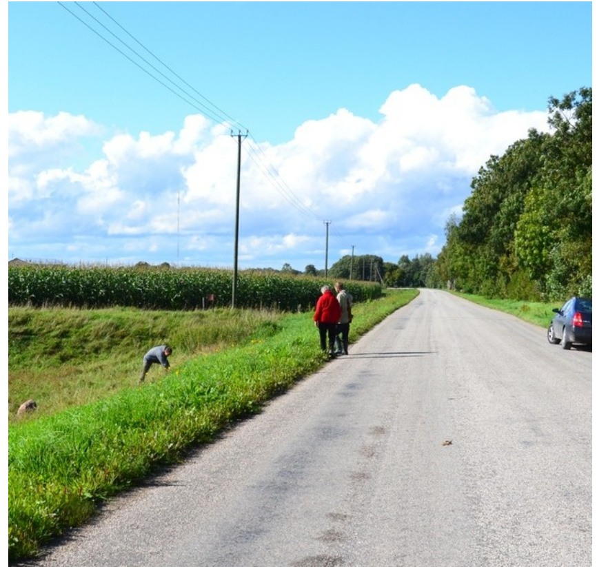
A local person showing the former location of the Inglise Village healing stone to researchers, and talking about what and how was healed there.