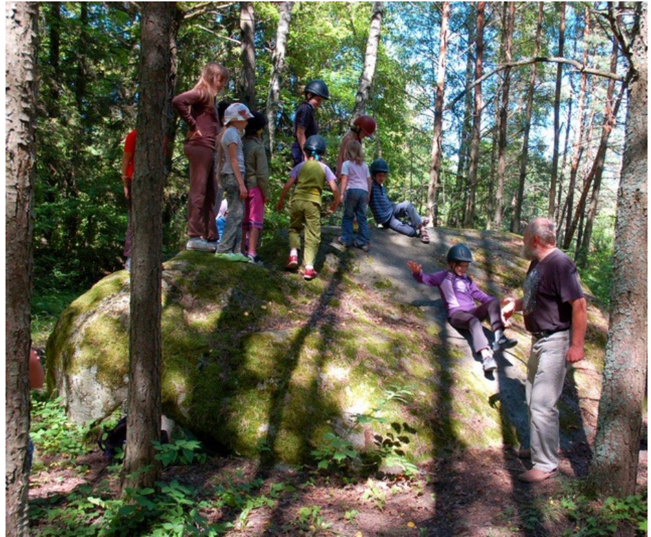
Children like to slide down from the Lalli Sliding Stone