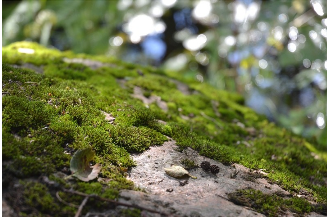
Sacred Grove Stone in Juuru Parish by the Atla River