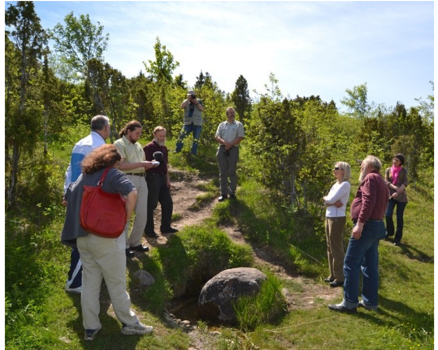
Kallaste Eye Spring is one of the most well-known tourism destinations in Muhu.