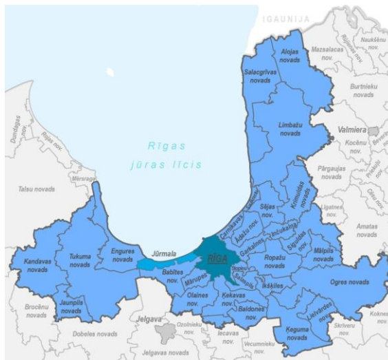
Riga Planning Region administrative division

Riga Planning Region Action Plan considerable attention is devoted to the region's diversity and characteristics of the individual parts of it – Riga Metropolitan Area, the Baltic Sea Gulf of Riga coast, the region's main cities, etc. The Action Plan serves as a document with an operational character – main focus is made on activities and projects section developed on the ideas and needs identified at the BALTIC FLOWS project organized meetings. In accordance with the Joint Action Plan approach it is essential to provide joint implementation of the actions in collaboration of local governments, business and research sectors, as well as ensuring public involvement, which is crucial for implementation of the actions. „Riga Planning Region Rainwater Management and Monitoring Plan” includes such perspective activities and projects in the medium term – for the period up to 2020.