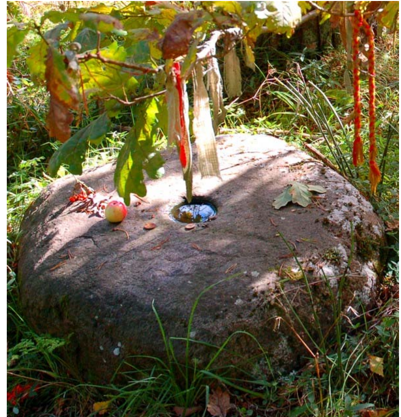
Traditions of nature religion related to sacred natural sites are still alive in Estonia. Sacred rock in Tammealuse grove in Virumaa.