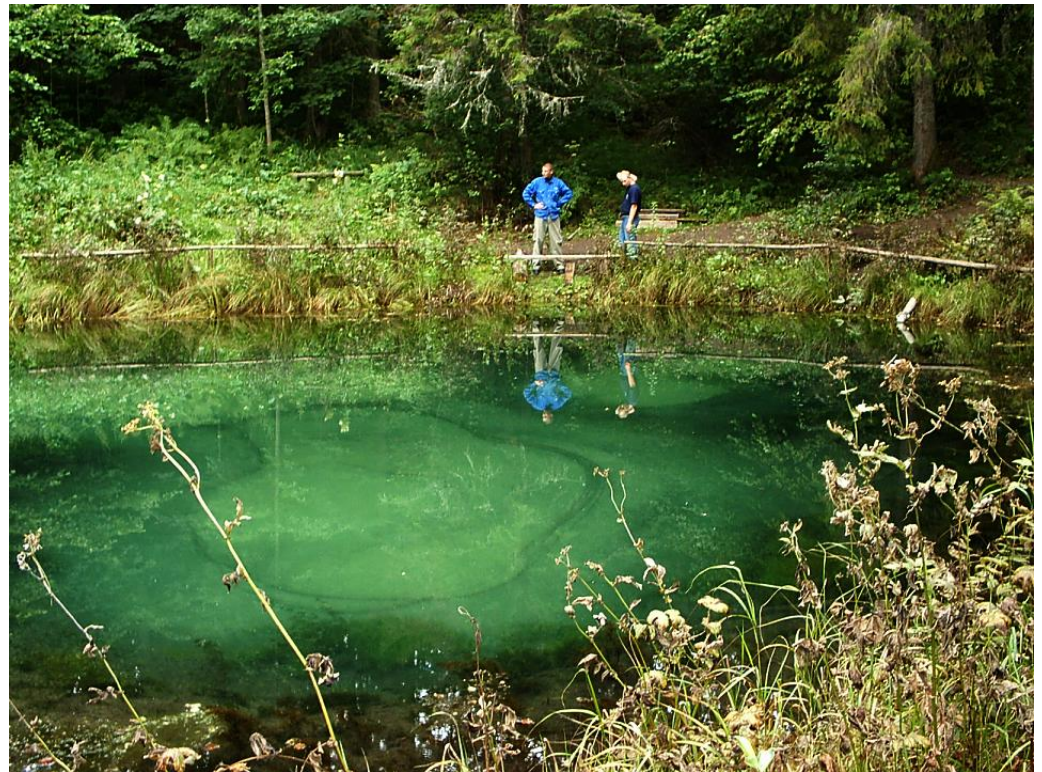
Saula Siniallika Grove, Harju county