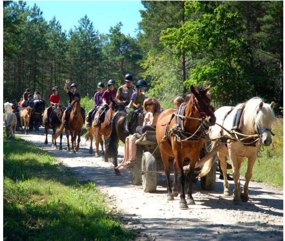
Muhumaa Tihuse tourism farm takes visitors to sacred natural sites on horseback along small village roads.