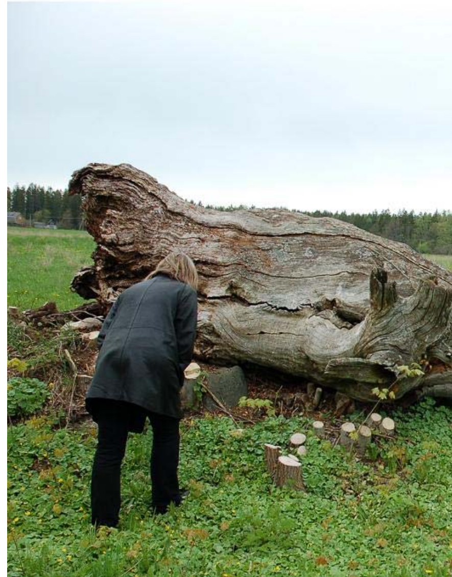
The trunk of Võlla Grove Oak broke after the young oaks were cut down. Natural renewal of the grove was interrupted because of lack of awareness. Muhumaa, Saare county