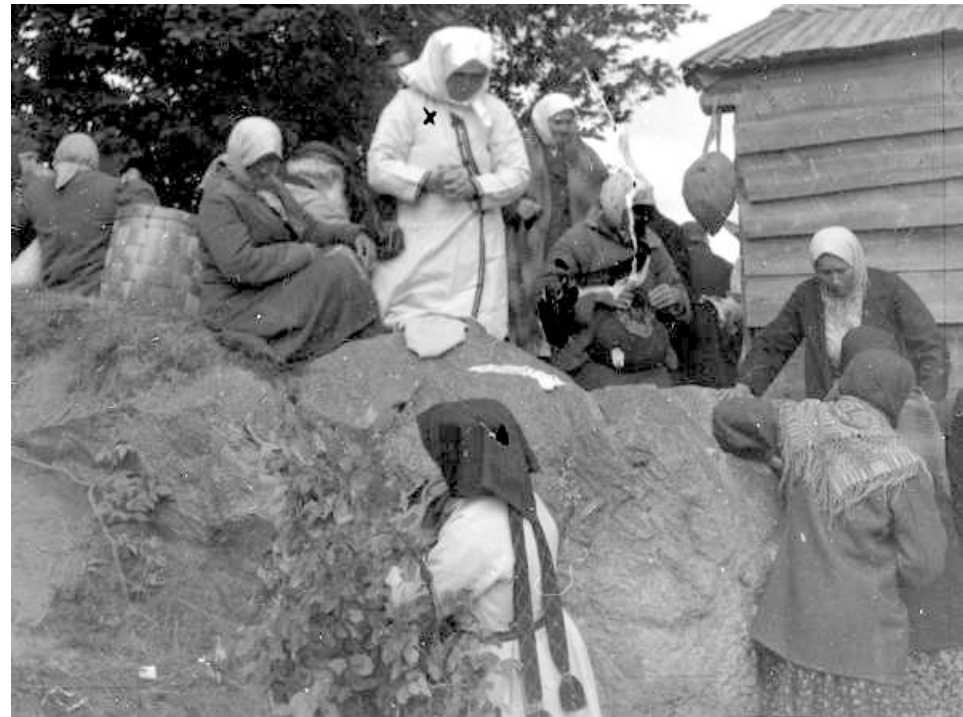
Meeksi Jaani Rock has been documented as a place of worship, sacrifice and healing for more than a century, and it is still being used by the community. Image: year 1937