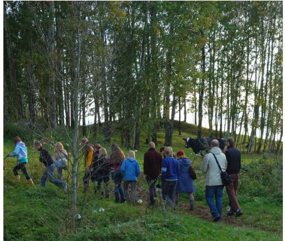
Excursion of students of Tartu University. Sacred hill, Mäletjärve village, Tartu county