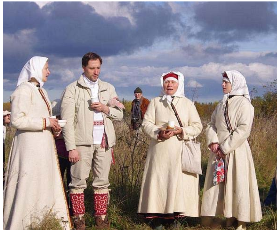
Representatives of indigenous people all over Estonia gathered at Kunda Hiiemäe (Grove Hill) Day in autumn 2009. Image: representatives of the Seto minority singing a welcome song.