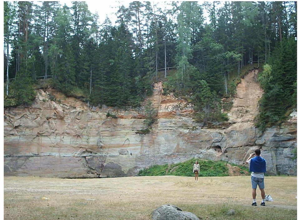
Taevaskoda (Heaven's Hall), Põlva county, Taevaskoja village.

The sacred natural site located in a nature protection area includes sandstone outcrops, a river, a sacred rock, springs and a meeting place.