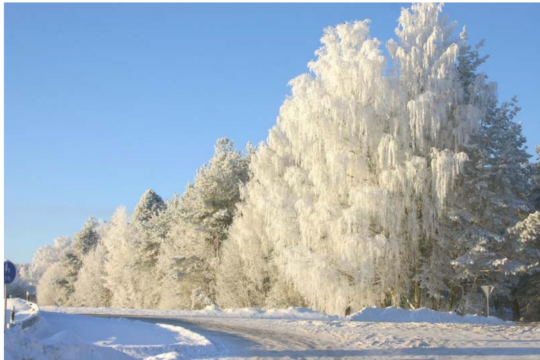
Sacred grove in Põlva county, Mamastõ village