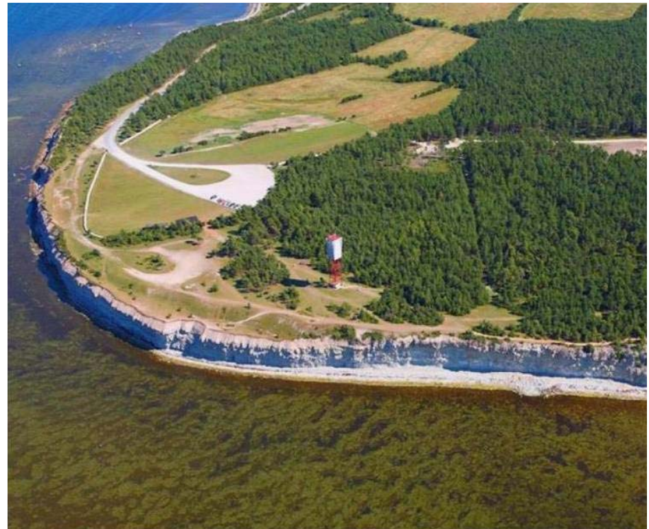
Panga Shelf, Saaremaa, Panga village. The most important site of the Mustjala county for prayers and sacrifice is located on the shelf taken under nature protection.